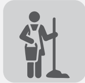
HOUSE KEEPING & JANITORIAL SERVICES